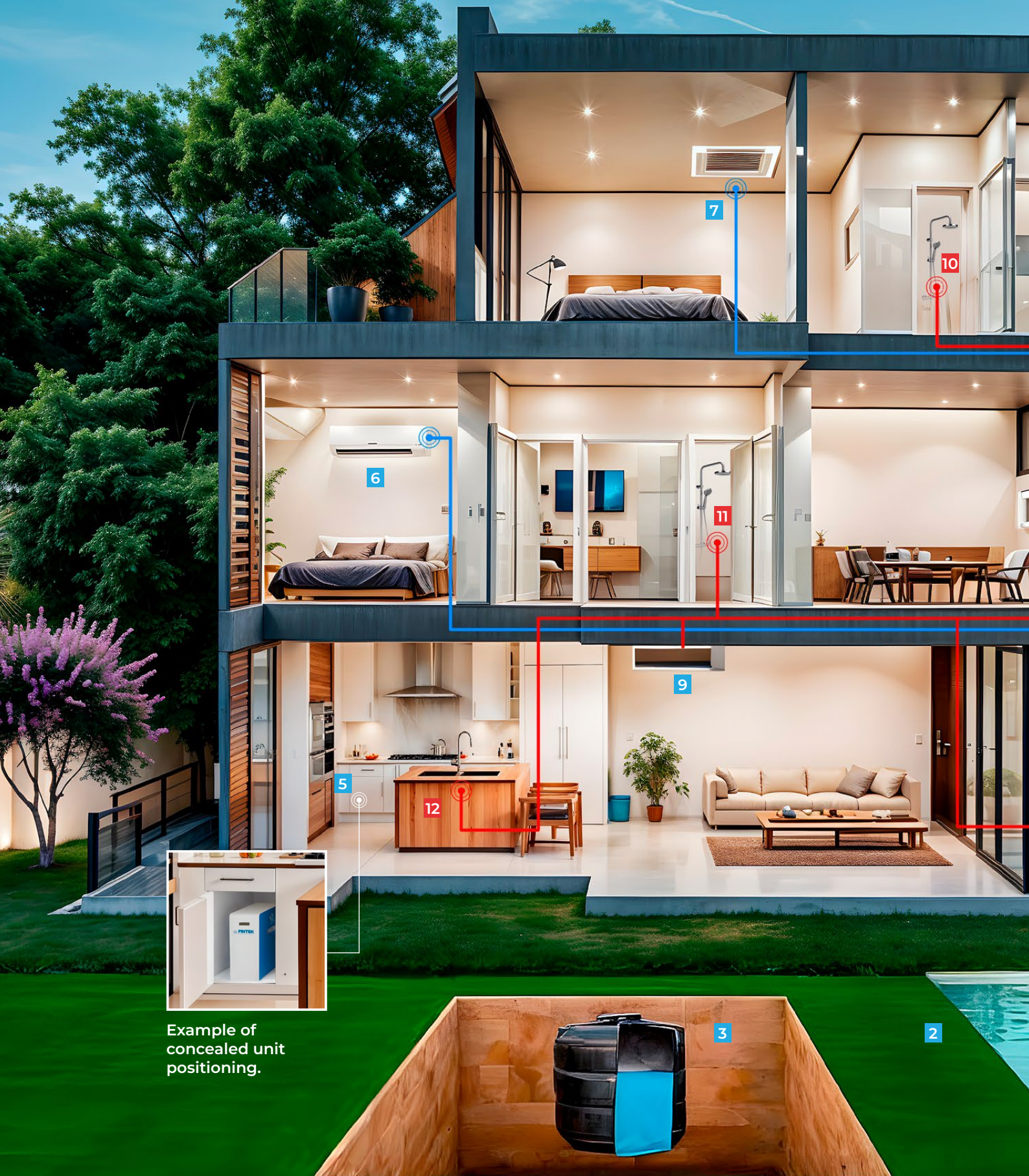
Example of concealed unit positioning.